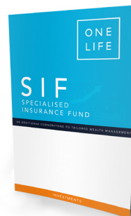
The specialised insurance fund