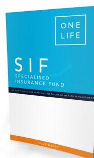
The specialised insurance fund